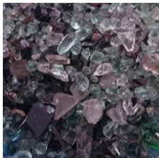
Fines - glass-rich fraction

Example of waste characterization to assess product and material recycling rates: End-of-Life Vehicles were dismantled and shredded; shredded fractions were weighted and sorted, their metallic content assessed to calculate overall recycling rates as well as metallic specific recovery rates. Pictures below show examples of sorted and analyzed fractions.